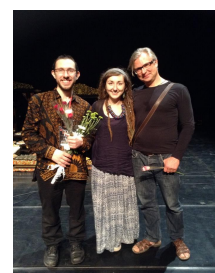
Flowers from the audience